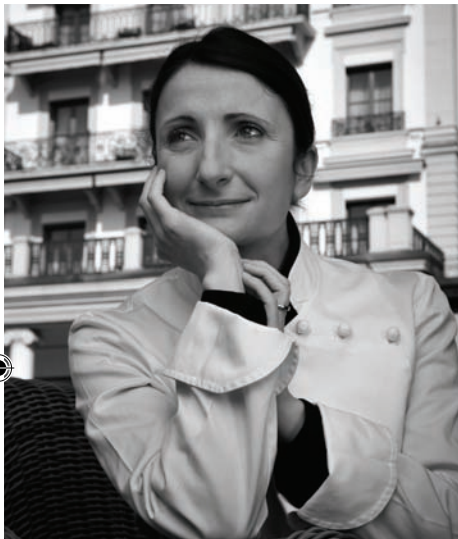
Superstar chef Anne-Sophie Pic carries an air of modesty, a rare trait in the male-dominated world of Michelin-starred chefs with sky-high egos (left)