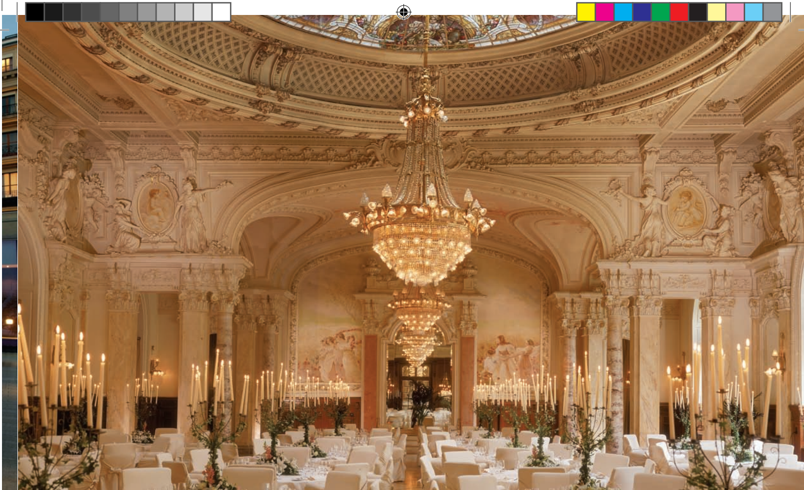
One of the hotel suites complete with a terrace overlooking Lake Geneva and the French Alps (left) and the ornate Anne-Sophie Pic Beau Rivage Palace restaurant which looks like a royal banqueting hall fit for Louis XVI (above)